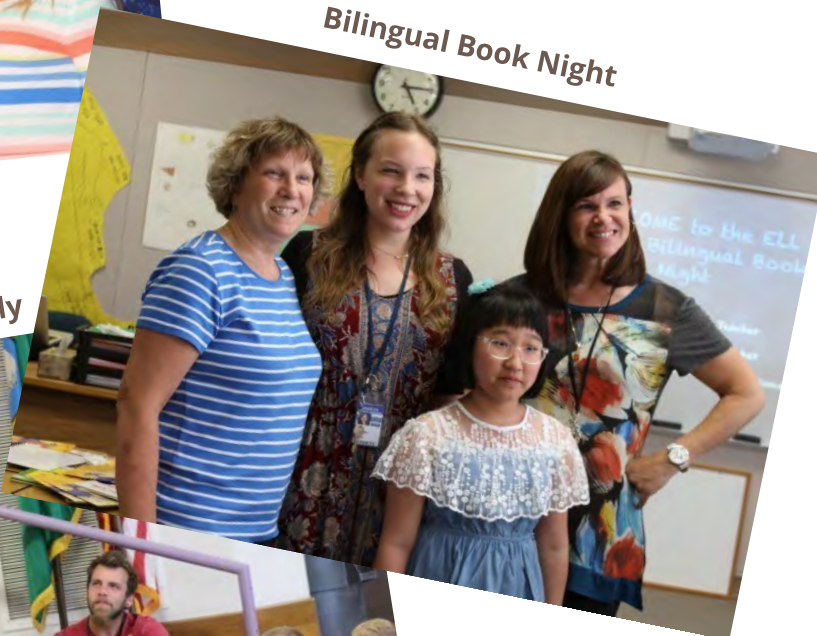
Bilingual Book Night