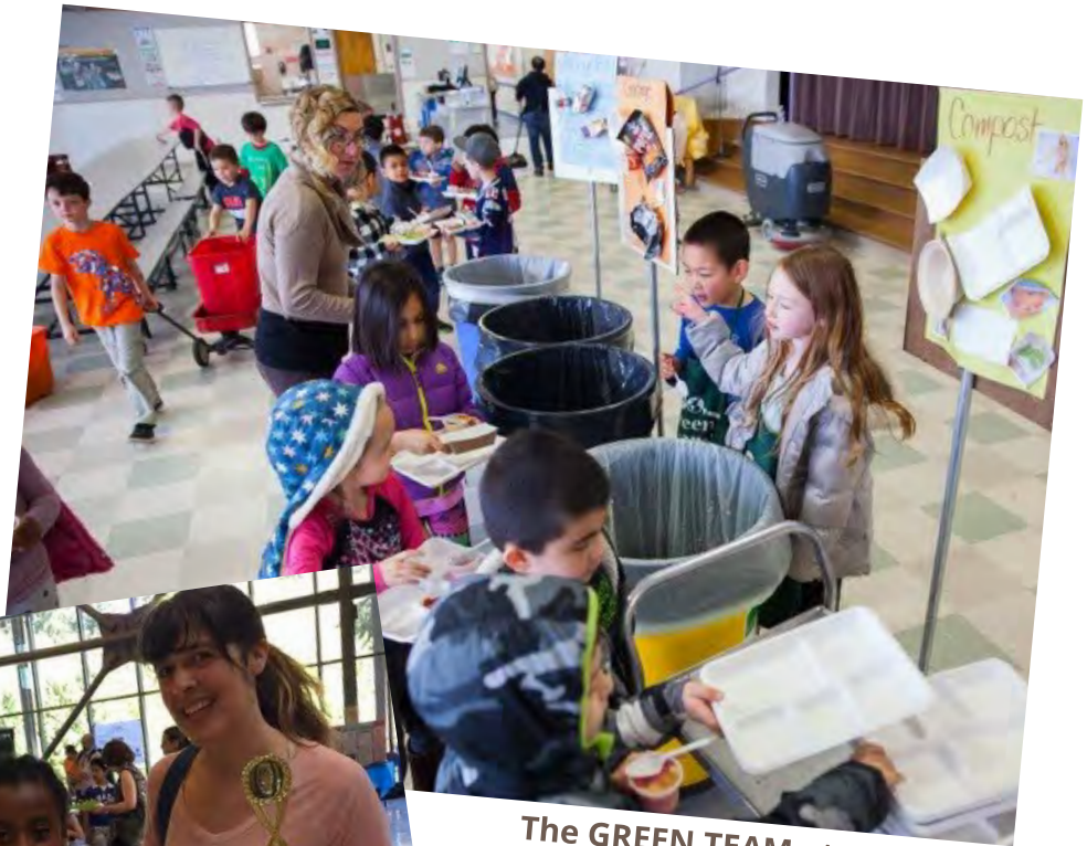
The GREEN TEAM at work