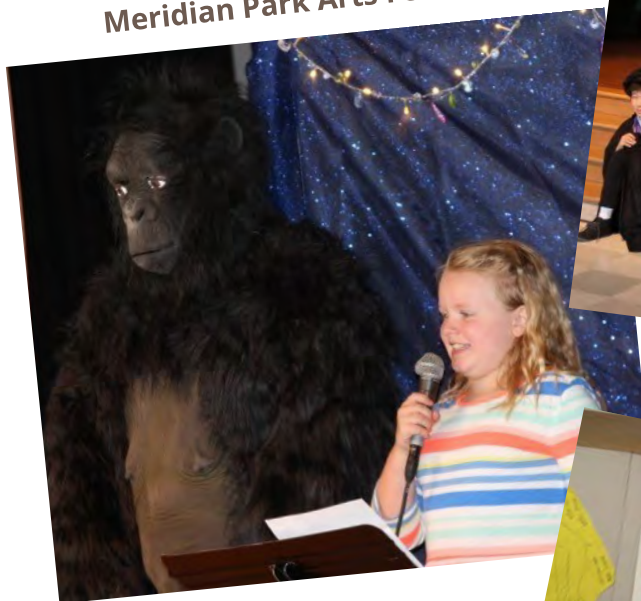
Meridian Park Arts Festival