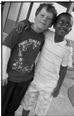
Ready for the first day of school!

Student Council will be starting in October! 2–6 graders can run for class representative and 5–6 graders can run for student body—President, Vice-President, Treasurer or Secretary. Start preparing your posters and slogans now!