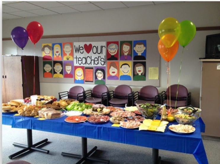
January Staff Appreciation "Sandwich Smorgasbord"

The next staff Appreciation Event will be an Italian-themed dinner on March 10th, the teachers' longest day of parent/teacher conferences. The event will be hosted by the kindergarten and 1st grade families but all are welcome to contribute.